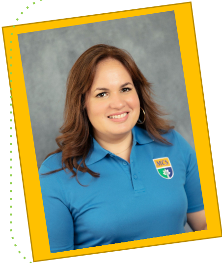
Mrs. Wanda Vásquez